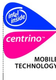
1" wide for print

To maintain the legibility of the Intel® Centrino™ logo, minimum size requirements have been set for logo reproduction in various applications.