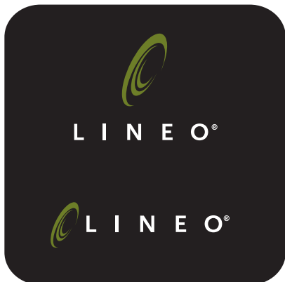
Reversed Out Logos